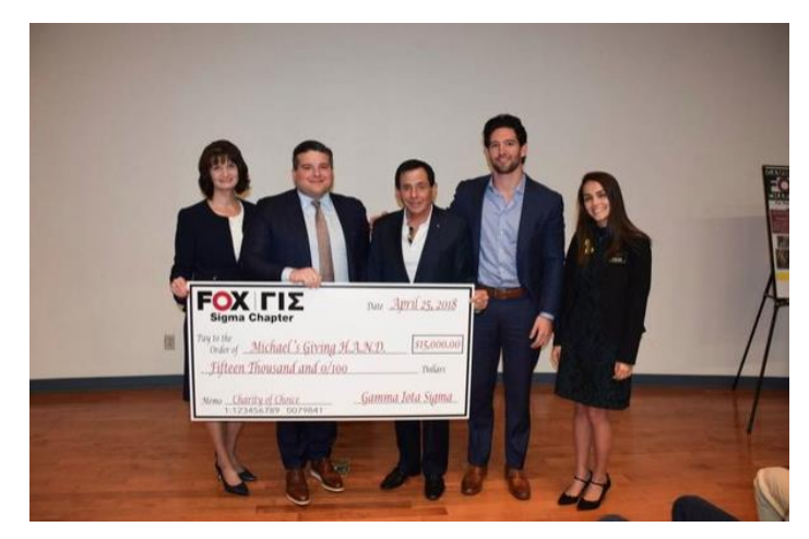
Sigma Chapter Raises over $25,000 for Michael's Giving H.A.N.D

The Sigma Chapter of Gamma lota Sigma hopes you enjoyed your summer! Here are some of the exciting things that the Sigma Chapter did between April and August: