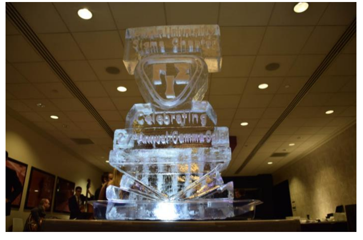
27th Annual Gamma Gala Friday, April 27, 2018