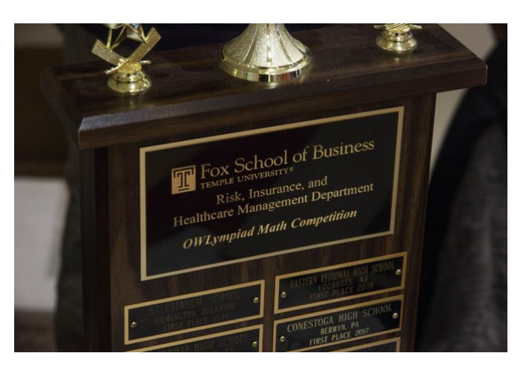
Owlympiad Math Competition Wednesday, May 16, 2018