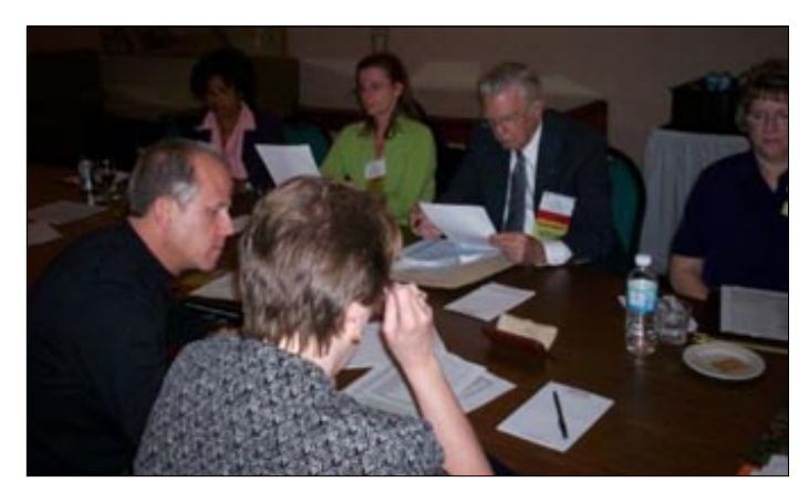
Above, the Annual Meeting of the Gamma lota Sigma Board of Trustees.