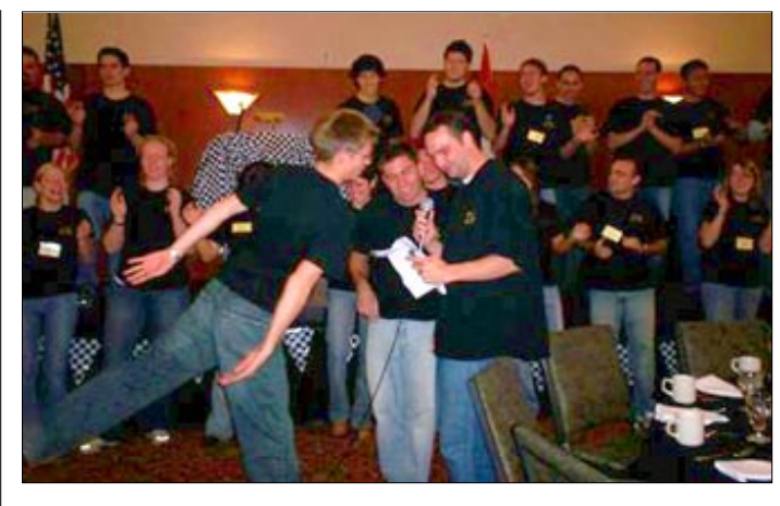
Above, Saturday's Roll Call Skit presented by Sigma, Temple University.