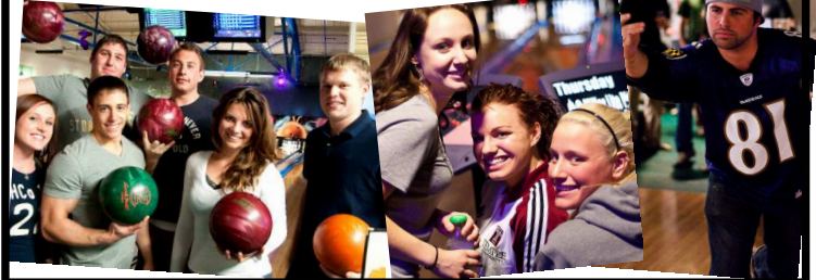
Bowling Extravaganza - 3/25/2010