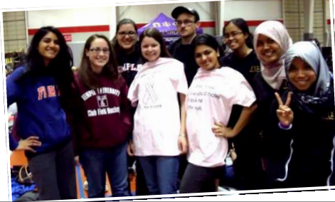
Relay for Life - 3/26/2010