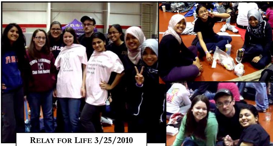
RELAY FOR LIFE 3/25/2010

Check out the Media Section of www.sigmachapter.org to see pictures of you at all of the great Gamma events of this semester!