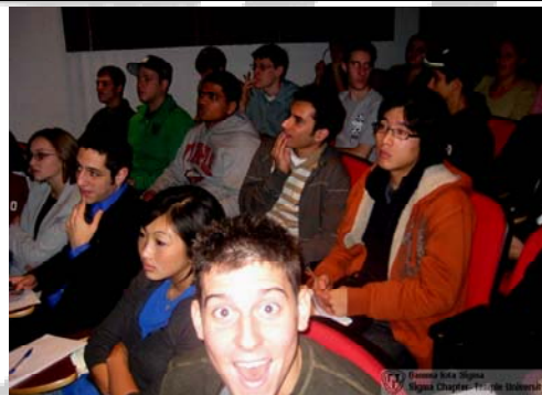
4. Gain invaluable information from industry professionals!