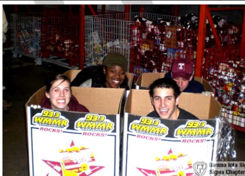
5. Give back to the community!