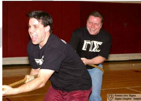
1. Grab a hold of your future...or at least learn how to pull heavy things.