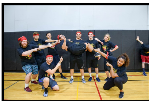
Team Elmer Fudd