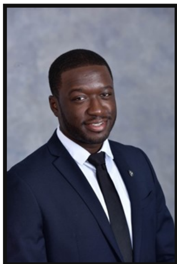
2018 Nancy Barrett Baglini Memorial Award for Professionalism and Ethics