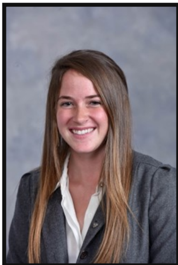
2018 Joseph E. Boettner Award for Excellence in Risk Management