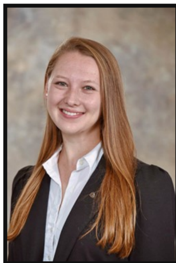
2018 Nancy Barrett Baglini Memorial Award for Professionalism and Ethics