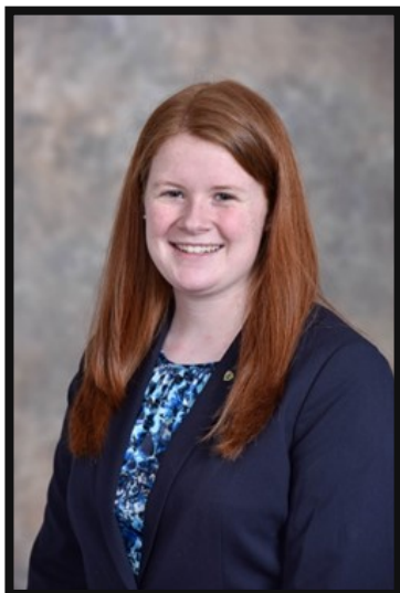
2018 Joseph E. Boettner Award for Excellence in Risk Management